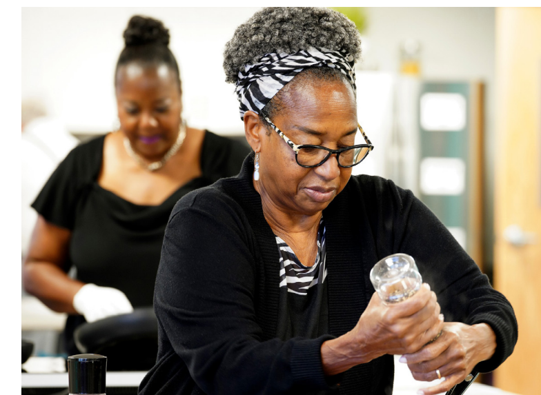
CommUNITY Wellness Center Cooking Class

“The ‘unity’ in CommUNITY Wellness Center says it all. We want to bring people together, and for everyone in our community to feel like this space is an extension of their family and home.”